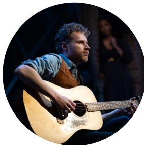
IF YOU COULD READ MY MIND: THE SONGS OF GORDON LIGHTFOOT Highest attendance and highest revenue in Belfry history.

A shout out to BMO Financial Group who, after carefully examining our PWYW data over the last three years, boldly stepped in as Access Sponsor for our upcoming season. Our many corporate partnerships allow us to collaboratively work together to make Victoria an arts city. Long-term public funding is a huge part of our success – thanks to the funders who respect the work of Belfry.