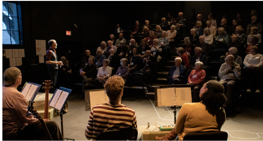
DIRECTOR'S CIRCLE FOR GORDON LIGHTFOOT