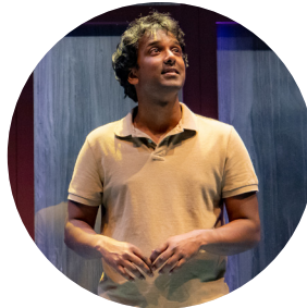
BEHIND THE MOON Highest single ticket sales and highest grossing production in February slot.