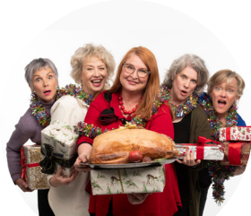
MOM'S THE WORD: TALKIN' TURKEY Highest grossing holiday show ever.

The Pay What You Want ticketing model remains a profound success. The philosophy of smashing all financial barriers and increasing access to the arts shapes this model. And it works so beautifully. It is so much easier for our audiences. No more 'hunt and peck' for the ideal seat on the ideal day for the ideal price. No more sorting through up to 38, yes 38, price points throughout the run of each production. Just buy a ticket for whichever day of the week, and at whatever price point works for you. And as a result, single ticket sales are booming. We have averaged an unheard of 50% new audiences for every show this season. And we broke box office records!