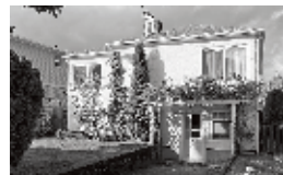
Current 1520 Clawthorpe Sears