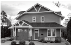
Current 1983 Watson East Saanich