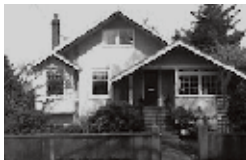
Current 2052 Byron Oak Bay